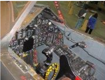
The flight instrumentation of SR-71 Blackbird

The airframe was made of titanium obtained from the USSR during the height of the Cold War . Lockheed used all possible guises to prevent the Soviet government from knowing what the titanium was to be used for. In order to keep the costs under control, they used a more easily worked alloy of titanium which softened at a lower temperature. Finished aircraft were painted a dark blue (almost black) to increase the emission of internal heat (the fuel was used as a heat sink for avionics cooling) and to act as camouflage against the sky.