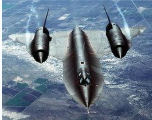
An SR-71 in flight

The Lockheed SR-71 Type A , unofficially known as the Blackbird , is a long-range, advanced, strategic reconnaissance aircraft developed from the Lockheed YF-12A and A-12 aircraft by Lockheed's Skunk Works (also responsible for the U-2 and many other advanced aircraft). The legendary " Kelly " Johnson , in particular, was the man behind many of the design's advanced concepts. The SR-71 was one of the first aircraft to be shaped to have an extremely low radar signature . The aircraft flew so fast and so high that if the pilot detected a surface-to-air missile launch, the standard evasive action was simply to accelerate. No SR-71 has ever been shot down.