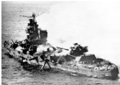
Heavy Japanese Cruiser Mikuma sunk at Battle of Midway