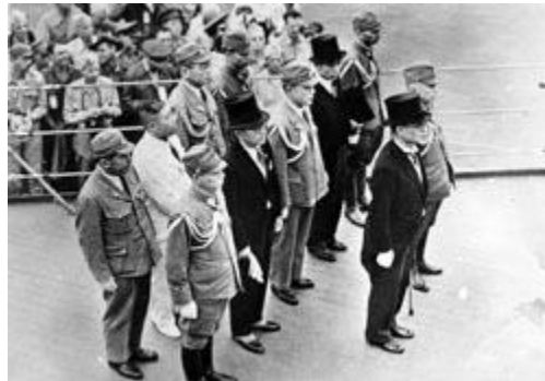
The Japanese surrender delegation lead by Foreign Minister Shigemitsu and Army Chief-of-Staff Umezu on the quarter-deck of Missouri