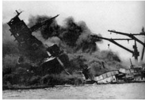
Death of the Battle Ship Arizona