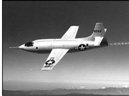
Bell XS-1 proving supersonic flight at Mach = 1.06.