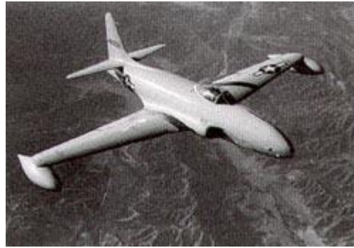
Lockheed F-80 (was P-80 ) "Shooting Star"