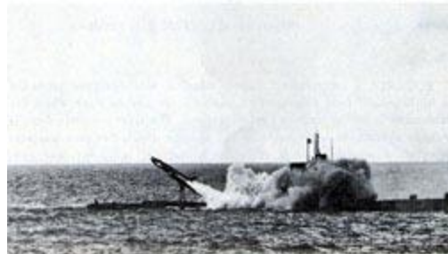
Regulus I leaving its submarine launch platform