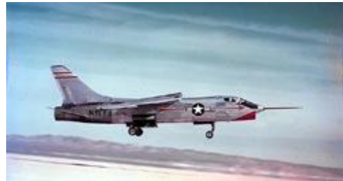
XF8U-1 Landing March 25, 1955