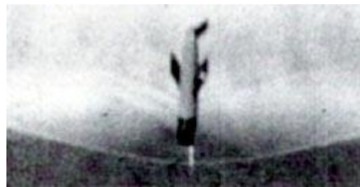
Shock wave built up in front of a