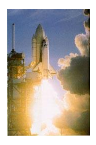
Space Shuttle at Lift-off