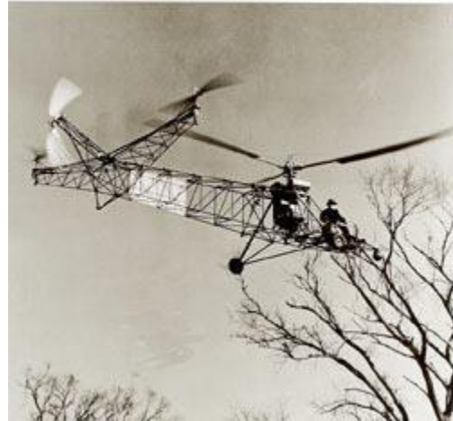
Igor Sikorsky at the controls of the Vought-Sikorsky VS-300.