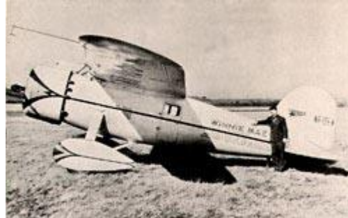
Lockheed “Winnie Mae” Flown around the world by Wiley Post